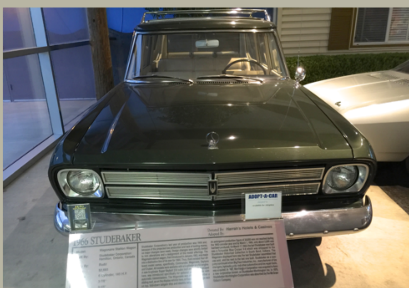
1966 Studebaker * 2nd to last