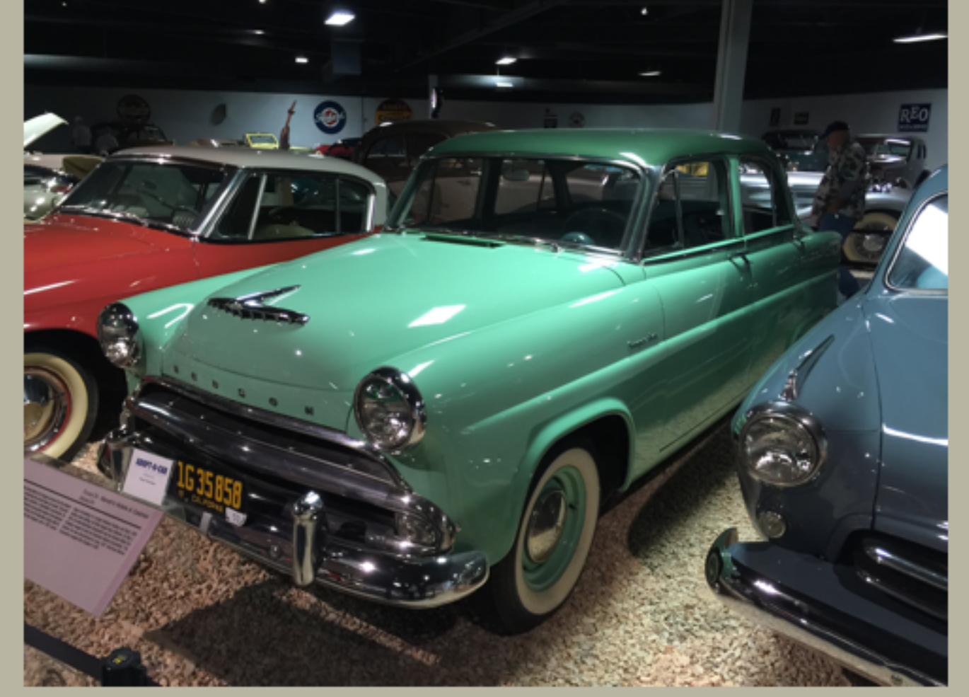
1953 Hudson Jet