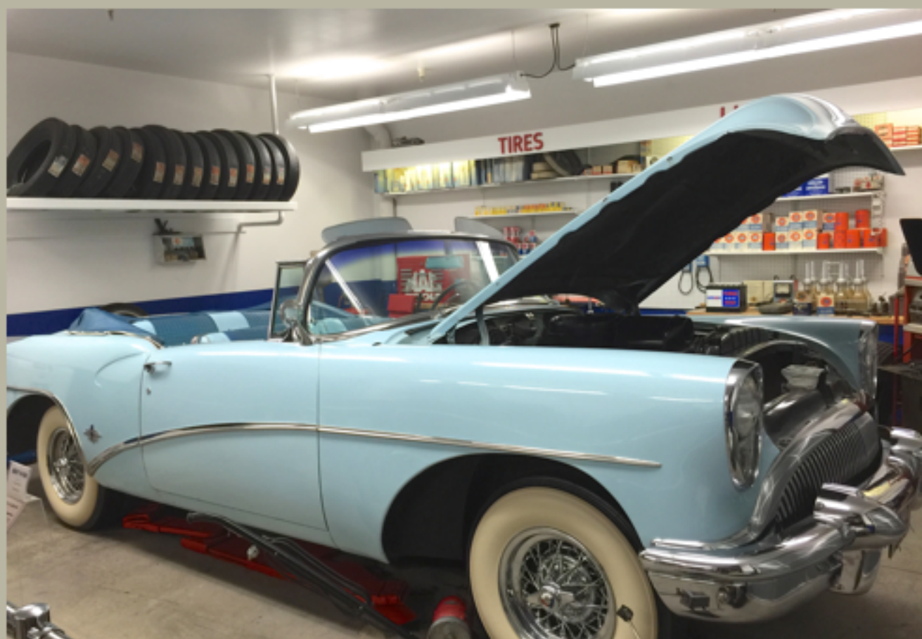
1954 Buick Skylark