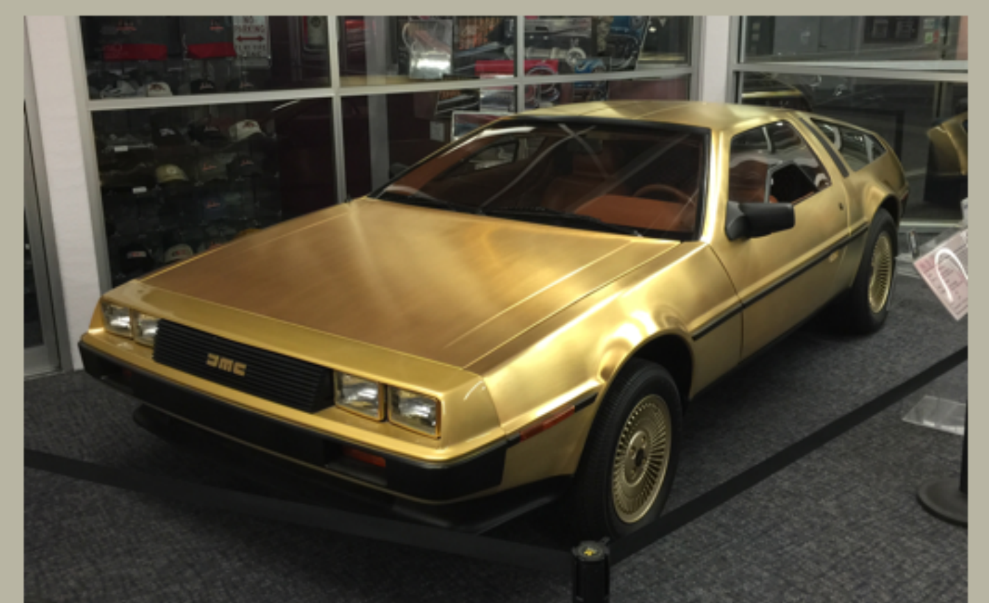
Gold Plated 1981 De Lorean