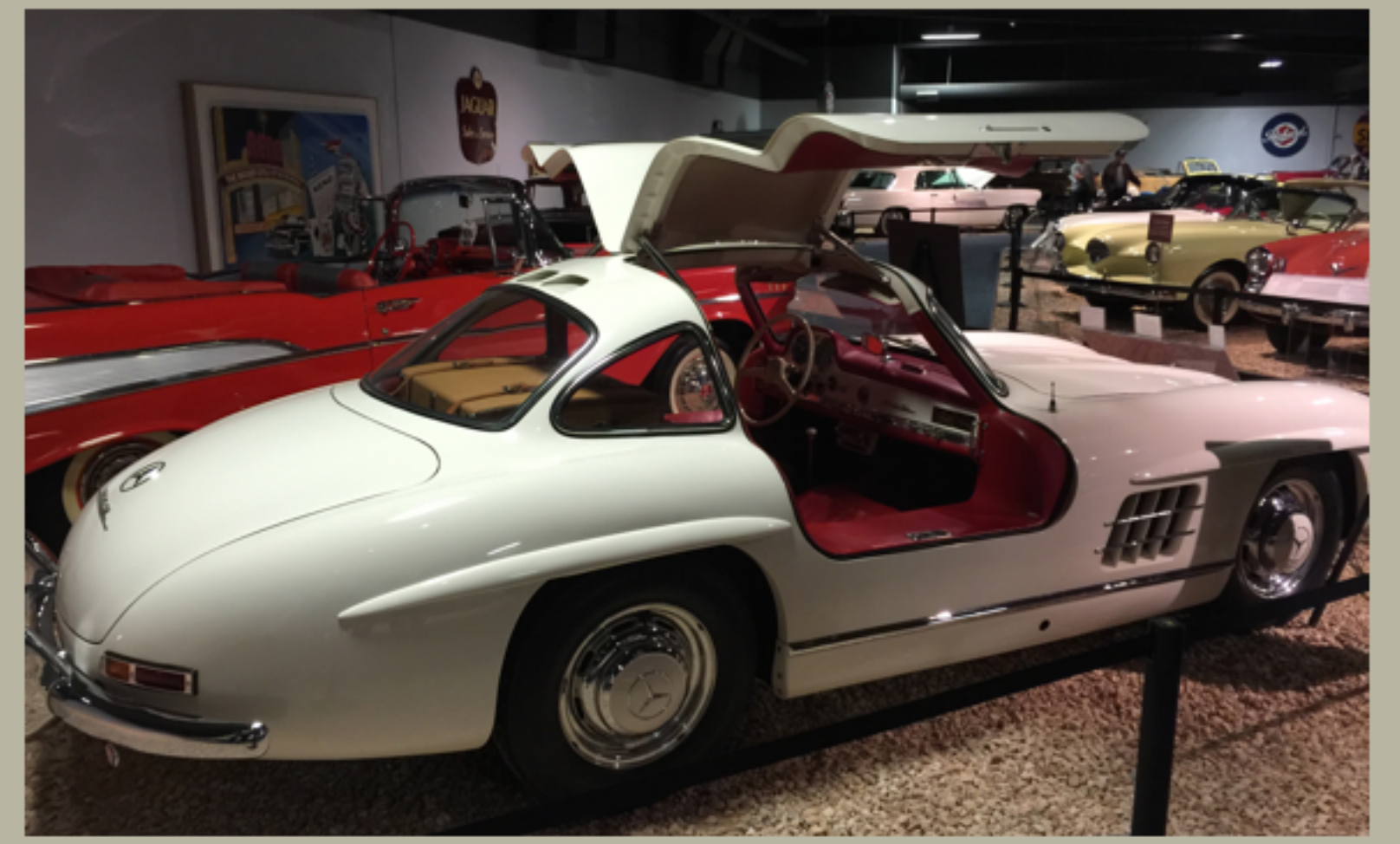
1954 Mercedes Benz 300SL