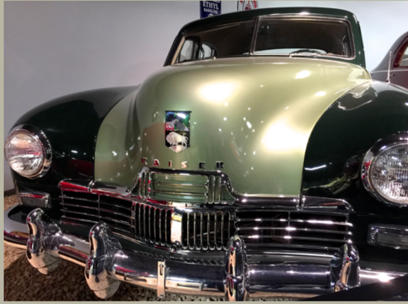
1947 Kaiser "Pinconning Special"