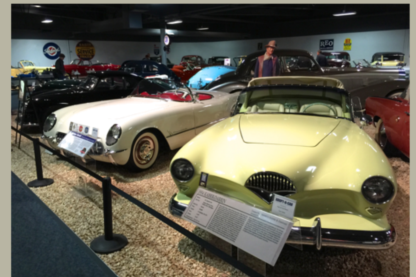
1954 Kaiser Darrin