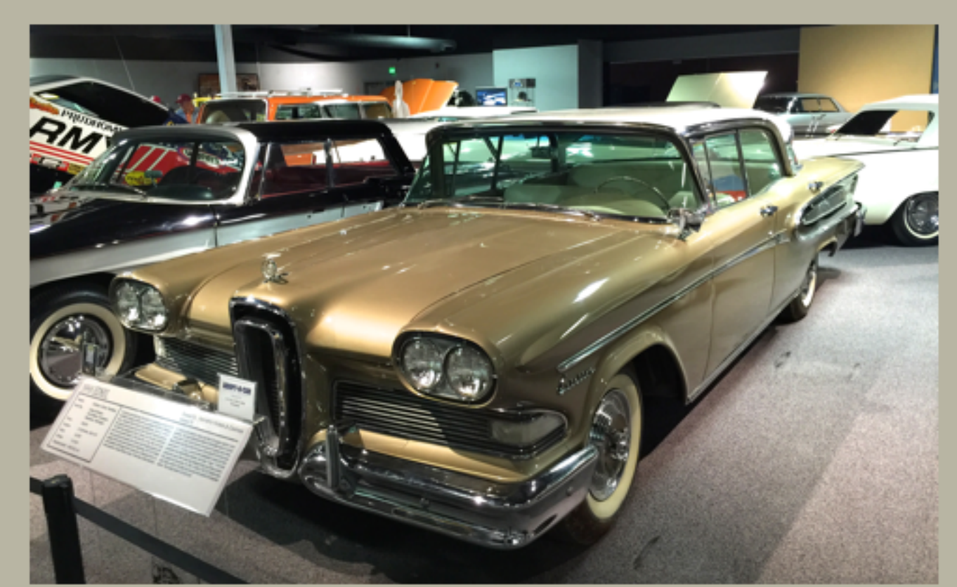
1958 Edsel Citation